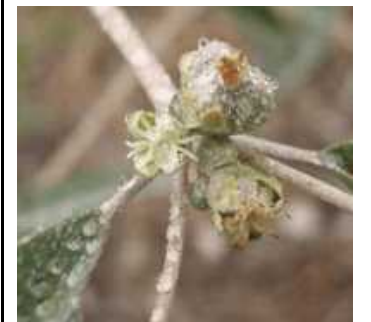
Female flowers and fruit